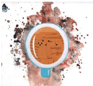
Paige Styles, Grade 11