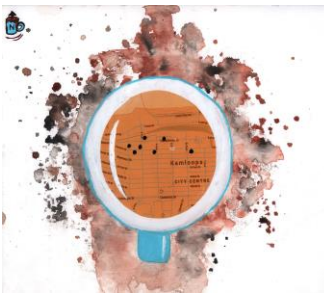
Paige Styles, Grade 11